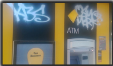
Remarkable VMS Graffiti Remover...cleaned up the bank without damage...Five minutes...Job well done!