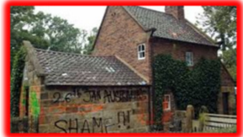
National Icon Captain Cooks Cottage, Melbourne, Victoria. Our instructions were clear..."remove graffiti without damage"...the result speaks for itself!